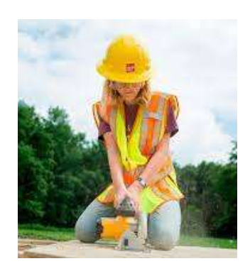
Tools - Hand and Power