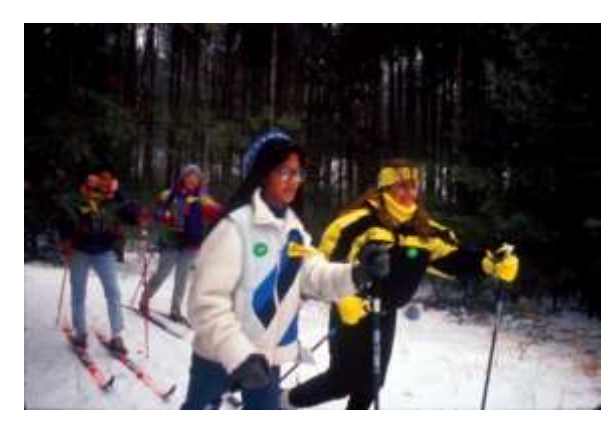
Cross Country Skiing