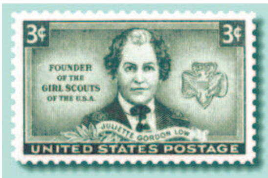
Juliette Gordon-Low Commemorative Stamp 1948

I will do my best to be honest and fair, friendly and helpful, considerate and caring, courageous and strong, and responsible for what I say and do. And to respect myself and others, respect authority, use resources wisely, make the world a better place, and be a sister to every Girl Scout.